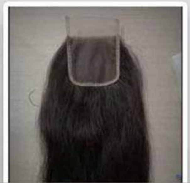
CLOSURES (4X4)-(5 X5)

NO SHEDDING NO TANGLING CAN BE BLEACHED CAN BE COLORED SINGLE DRAWN