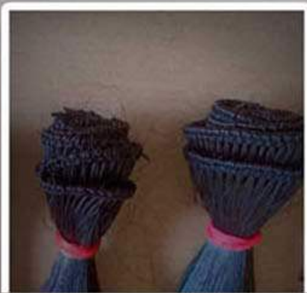
HAND TIED - 3THREAD