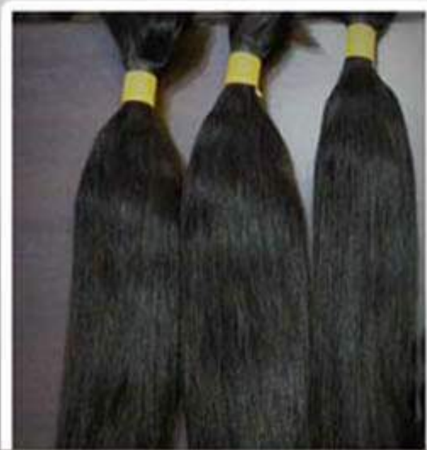
BULK - LOOSE - BRAIDING

Manufacturer and Wholesale Exporter of Indian 100% Raw Human Hair in Black, brown and grey Natural colours direct from the temples of South India from 10' to 32' inches with Cuticles aligned in same direction with single drawn mode in Straight Wavy and Curly Natural Textures.