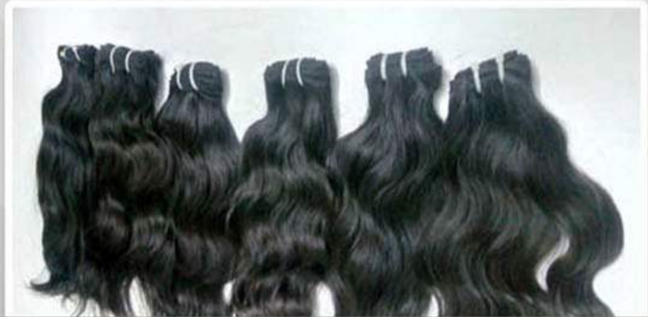
MACHINE WEFTED HAIR